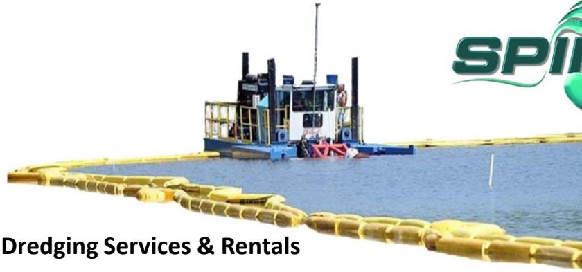
Dredging Services & Rentals